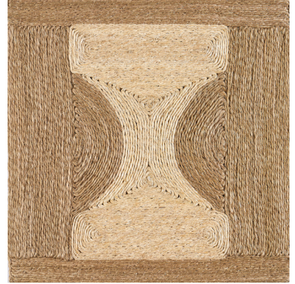
2' X 2' SAMPLE SHOWN