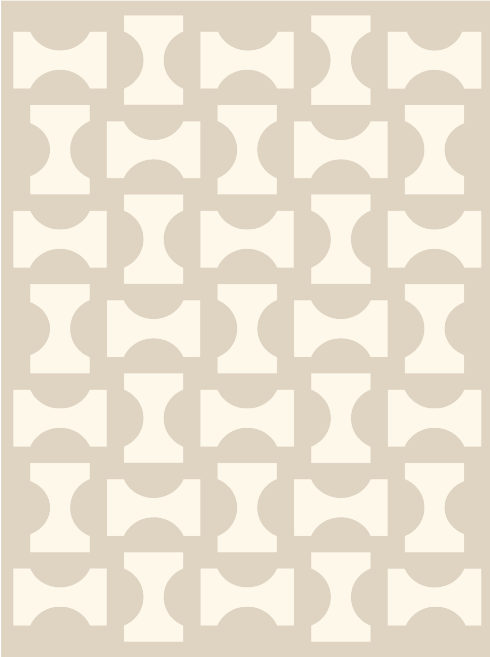
ARTWORK FOR 9' X 12' RUG SHOWN