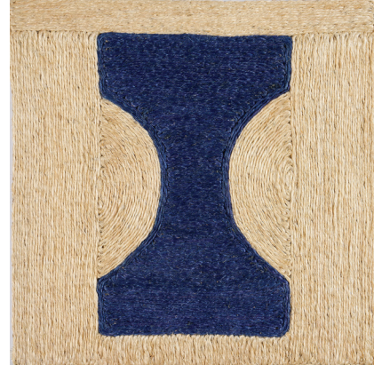
2' X 2' SAMPLE SHOWN