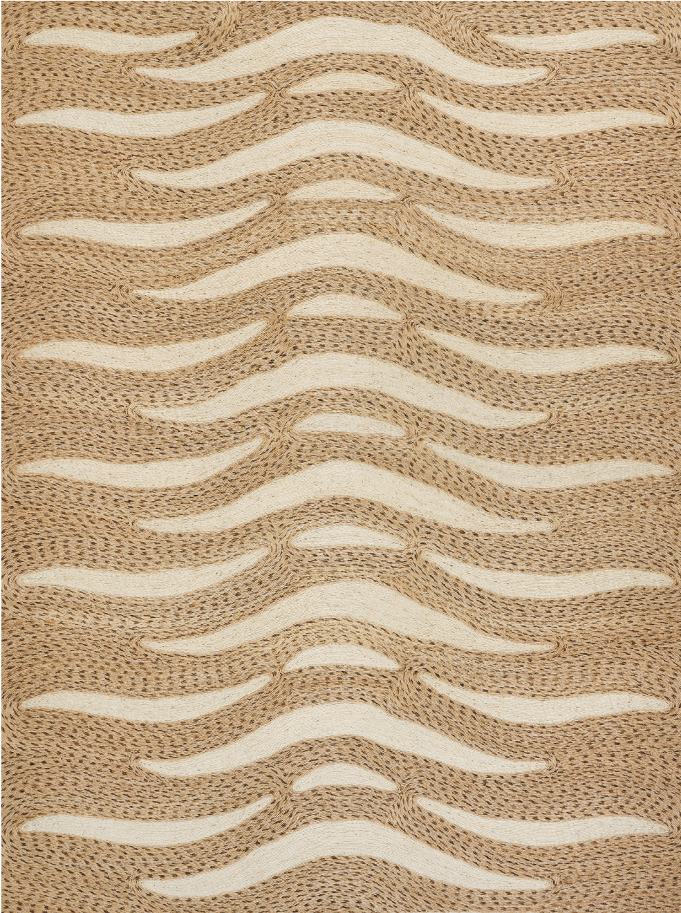
9' X 12' RUG SHOWN

COLOR: SANDSTONE FIBER: ABACA GROUP# 900