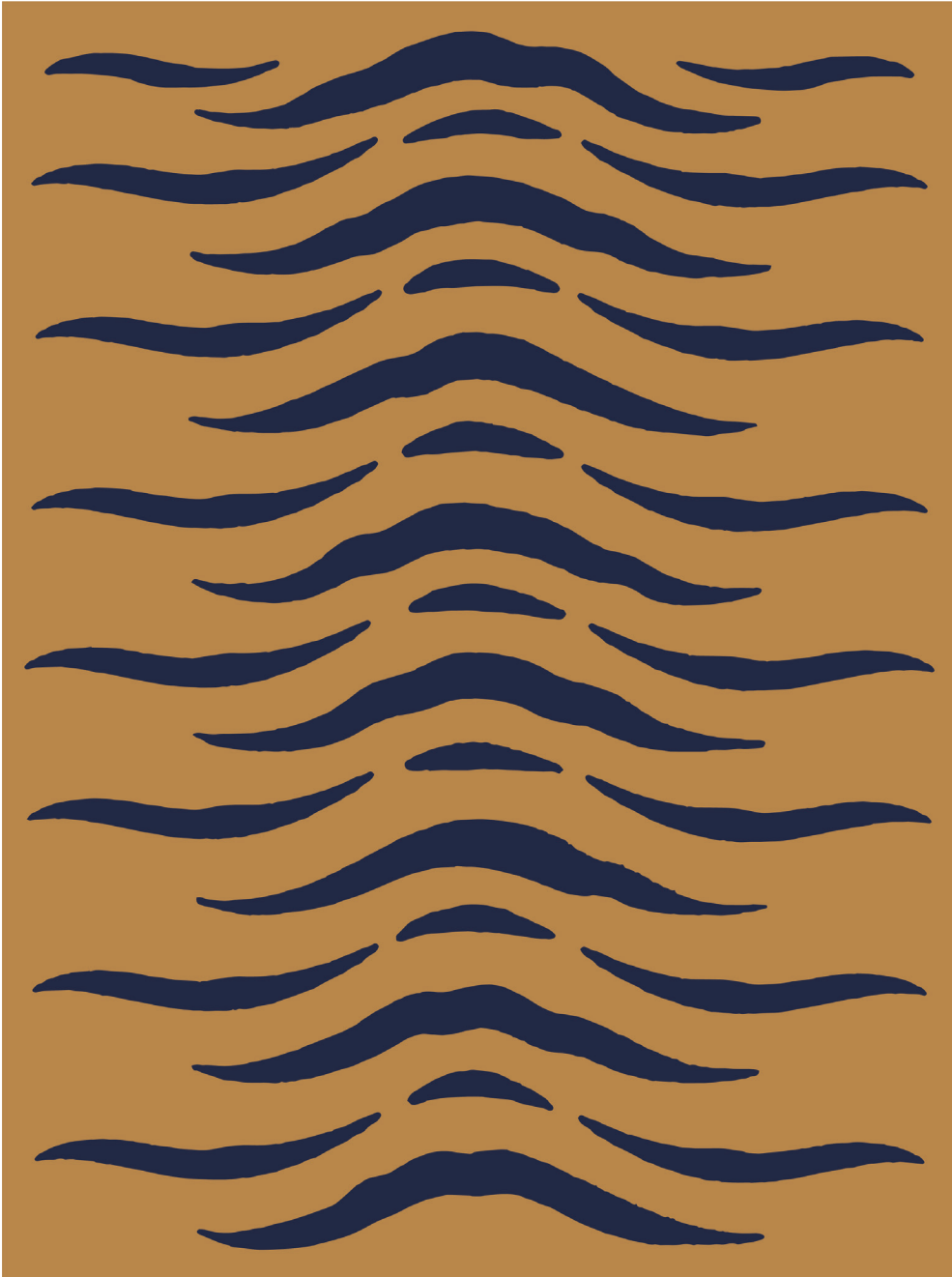
ARTWORK FOR 9' X 12' RUG SHOWN

COLOR: LAPIS & GOLD FIBER: ABACA GROUP# 900