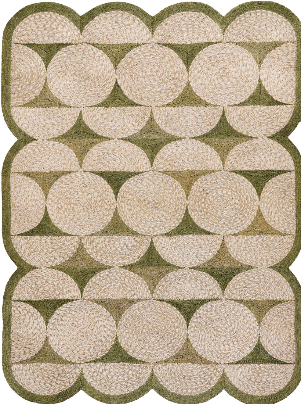
9' X 12' RUG SHOWN