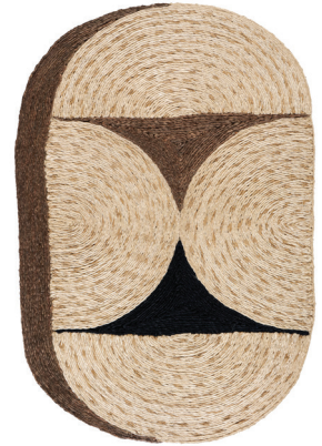
2'3" X 3'5" SAMPLE SHOWN