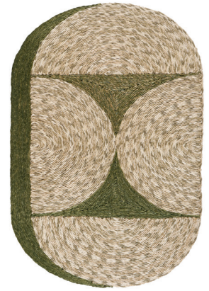
2'3" X 3'5" SAMPLE SHOWN