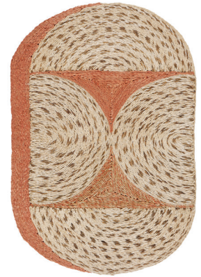
2'3" X 3'5" SAMPLE SHOWN