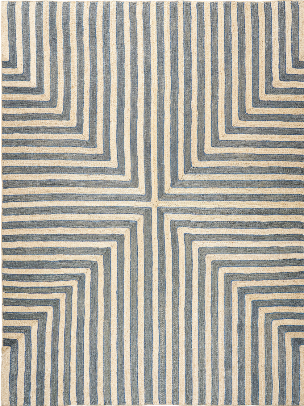
9' X 12' RUG SHOWN