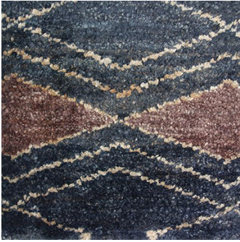
CATARO HAND-KNOTTED JUTE 62207