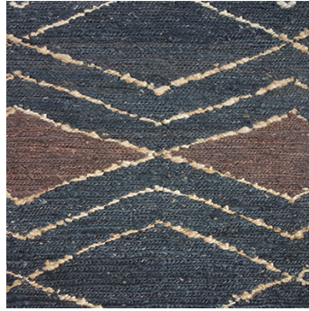
CATARO HAND-KNOTTED JUTE 62212