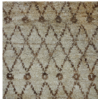
MATEO HAND-KNOTTED JUTE 62203

DON'T FORGET- ANY OF THESE PATTERNS CAN BE CUSTOMIZED!