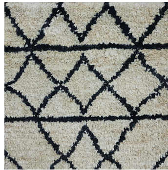
KASARA HAND-KNOTTED JUTE 62191