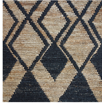
FARON HAND-KNOTTED JUTE 62199