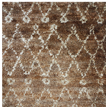
MATEO HAND-KNOTTED JUTE 62205