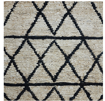
KASARA HAND-KNOTTED JUTE 62195