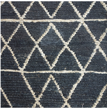
KASARA HAND-KNOTTED JUTE 62192