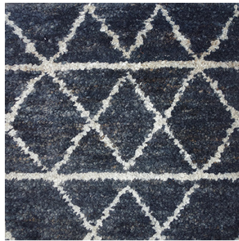
KASARA HAND-KNOTTED JUTE 62196