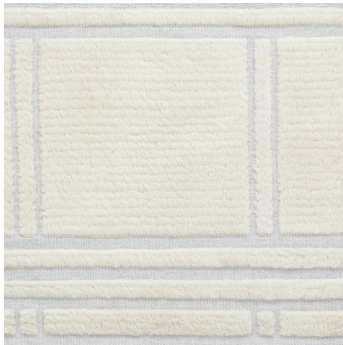
SERABA MIXED TEXTURE WOOL & METAL 75055