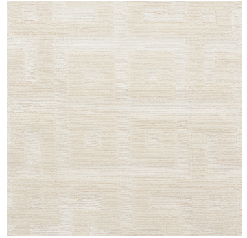
PANEO HAND-KNOTTED WOOL & SILK 75016