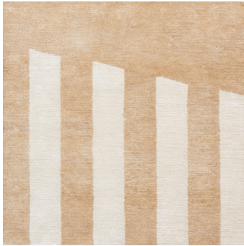
FUJAMO HAND-KNOTTED ALLO & SILK 75013