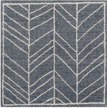
FOSCAN HAND-KNOTTED WOOL & SILK 75058