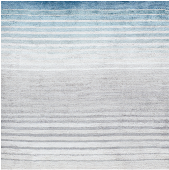
STRIPE HORIZON HAND-KNOTTED BANANA SILK 75039