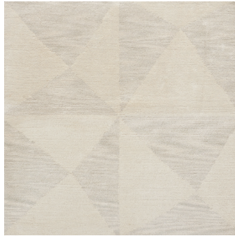
GERRITS HAND-KNOTTED SILK 75024