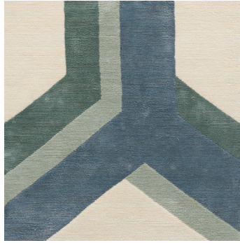
VITUS HAND-KNOTTED WOOL & SILK 75010