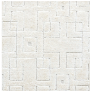
ISIMAR MIXED TEXTURE FAUX SILK & METAL 75052

DON'T FORGET- ANY OF THESE PATTERNS CAN BE CUSTOMIZED!