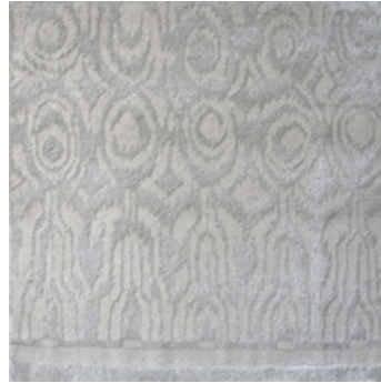
MARADI HAND-KNOTTED WOOL & SILK 57758