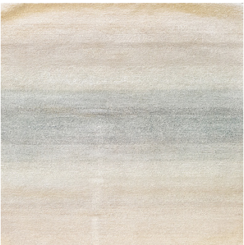
FADE HAND-KNOTTED WOOL & SILK 70357