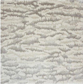
MAGNA HAND-KNOTTED WOOL & SILK 54146