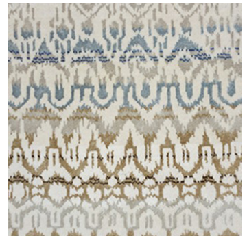
MOCOLO HAND-KNOTTED WOOL & SILK 54144

DON'T FORGET- ANY OF THESE PATTERNS CAN BE CUSTOMIZED!