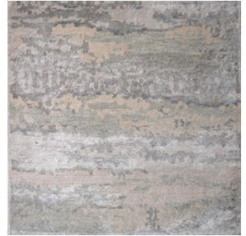
MATALA HAND-KNOTTED WOOL & SILK 54150