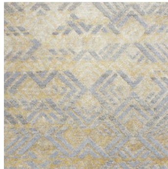
MINYA HAND-KNOTTED WOOL & SILK 57755