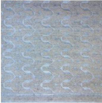
BELFRY HAND-KNOTTED WOOL & SILK 56597