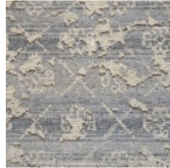
MING HAND-KNOTTED WOOL 56607