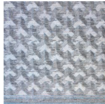
VARIGATE HAND-KNOTTED WOOL 56605

DON'T FORGET- ANY OF THESE PATTERNS CAN BE CUSTOMIZED!