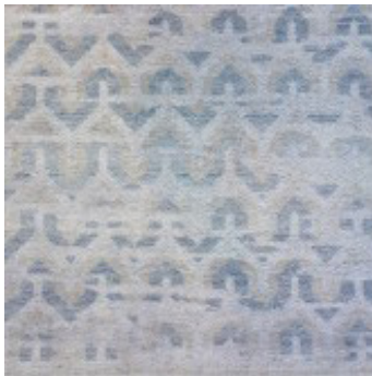
SPIRE HAND-KNOTTED WOOL 56601