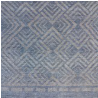
MONARCH HAND-KNOTTED WOOL 56603