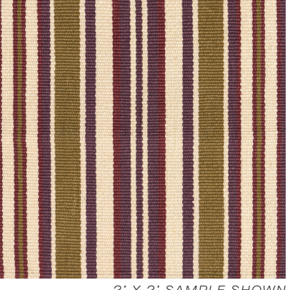
2' X 2' SAMPLE SHOWN