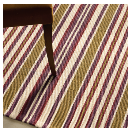
ARTWORK FOR 9' X 12' RUG SHOWN