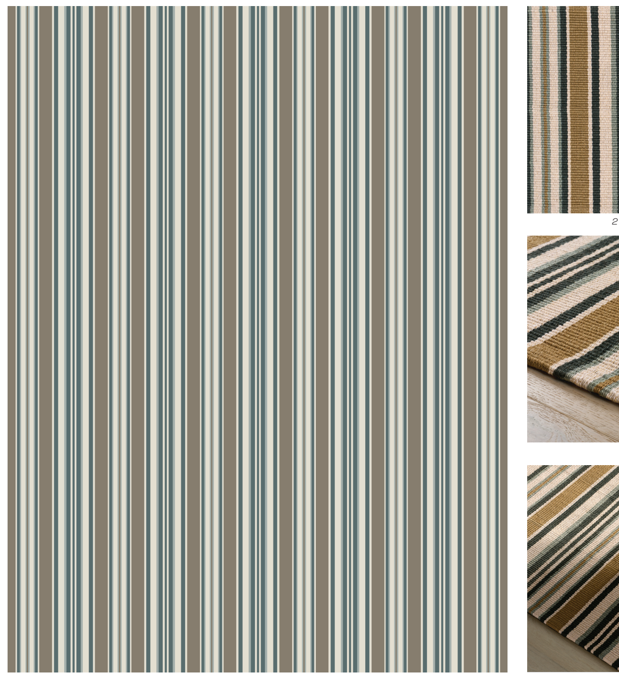
ARTWORK FOR 9' X 12' RUG SHOWN