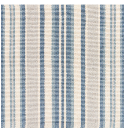
2' X 2' SAMPLE SHOWN