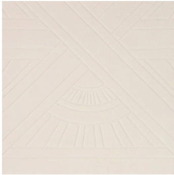
FAULKNER HAND-TUFTED WOOL 71585