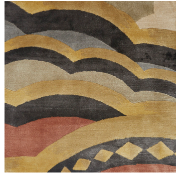
SALON ROYALE HAND-KNOTTED SILK 71573