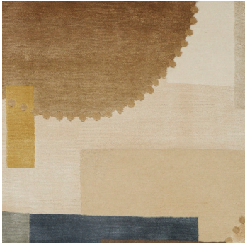
COTTON CLUB HAND-KNOTTED WOOL & SILK 71576