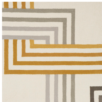
CLUB ARGONAUT HAND-TUFTED WOOL & SILK 71594