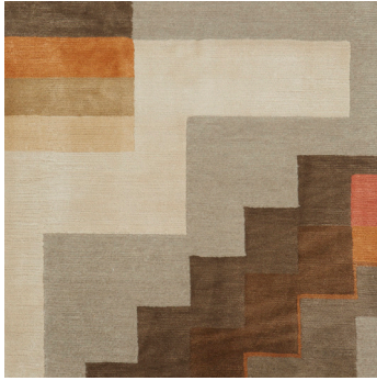
CHUMLEY'S HAND-KNOTTED SILK 71579