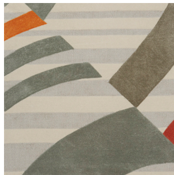
STORK CLUB HAND-TUFTED WOOL & SILK 71591

DON'T FORGET- ANY OF THESE PATTERNS CAN BE CUSTOMIZED!