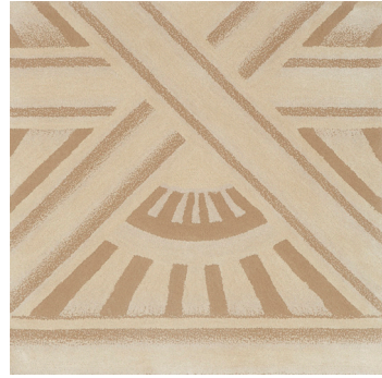
FAULKNER HAND-TUFTED WOOL & SILK 71582