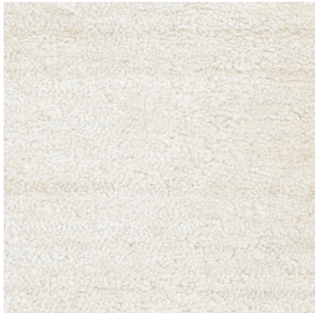
PLAINWEAVE HAND-KNOTTED BAMBOO SILK 75026