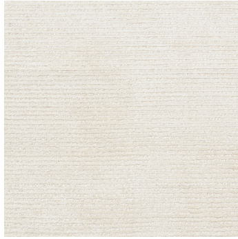
RIBS HAND-KNOTTED WOOL & SILK 75020