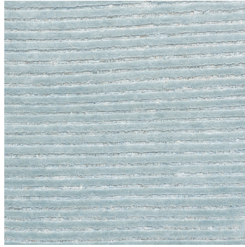
DOUBLE BARS HAND-KNOTTED ALLO & SILK 75032