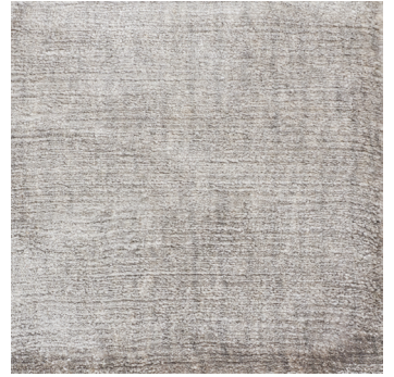
PLAINWEAVE HAND-KNOTTED BANANA SILK 75041