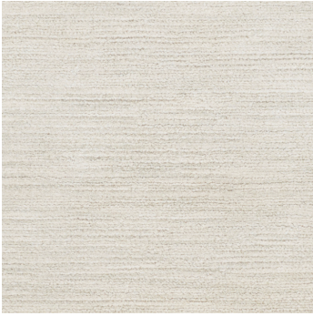
BRINDLE HAND-KNOTTED SILK 75021