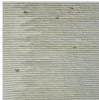
SERENITY FLATWEAVE WOOL, SILK & VISCOSE 52806