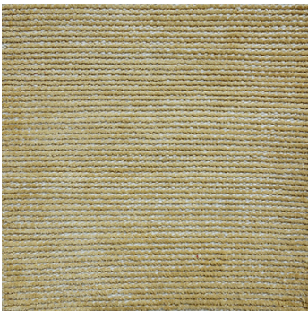
POINT BLANK FLATWEAVE WOOL & SILK 52818