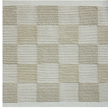
CHECKERS FLATWEAVE PASHMINA & SILK 52813