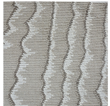
SKITTISH FLATWEAVE PASHMINA & SILK 52808

DON'T FORGET- ANY OF THESE PATTERNS CAN BE CUSTOMIZED!