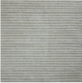
BANDEAU FLATWEAVE WOOL, SILK & FAUX SILK 52815