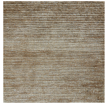
POINT BLANK FLATWEAVE WOOL & SILK 52817