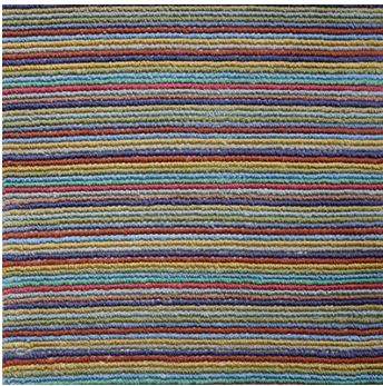
FANTASTIC FLATWEAVE BAMBOO SILK 52521