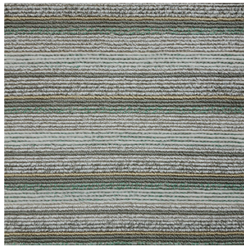
ILLUSIVE FLATWEAVE PASHMINA, SILK & BAMBOO SILK 52517