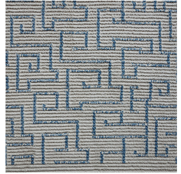
DISORDERLY FLATWEAVE PASHMINA, SILK & BAMBOO SILK 52523