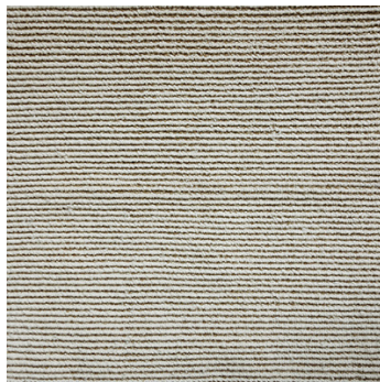
POINT BLANK FLATWEAVE JUTE & SILK 52881