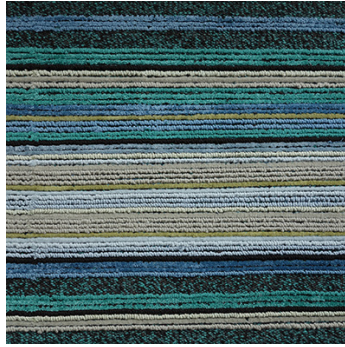
CAPRICIOUS FLATWEAVE PASHMINA & BAMBOO SILK 52519