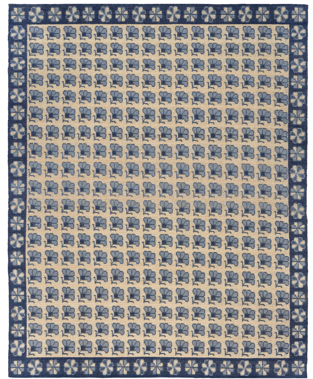
ACTUAL 8' X 10' RUG SHOWN

COLOR: PORCELAIN BLUE FIBER: ABACA GROUP# 900