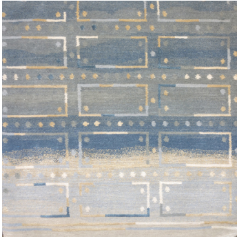
AKEMI HAND-KNOTTED WOOL & SILK 59121