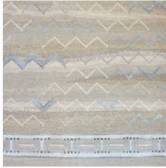
NOBURU HAND-KNOTTED WOOL & SILK 59130