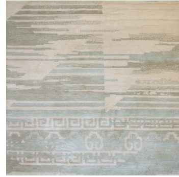
SHIORI HAND-KNOTTED WOOL & SILK 59124