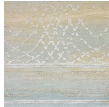
YUA HAND-KNOTTED WOOL & SILK 59115

DON'T FORGET- ANY OF THESE PATTERNS CAN BE CUSTOMIZED!