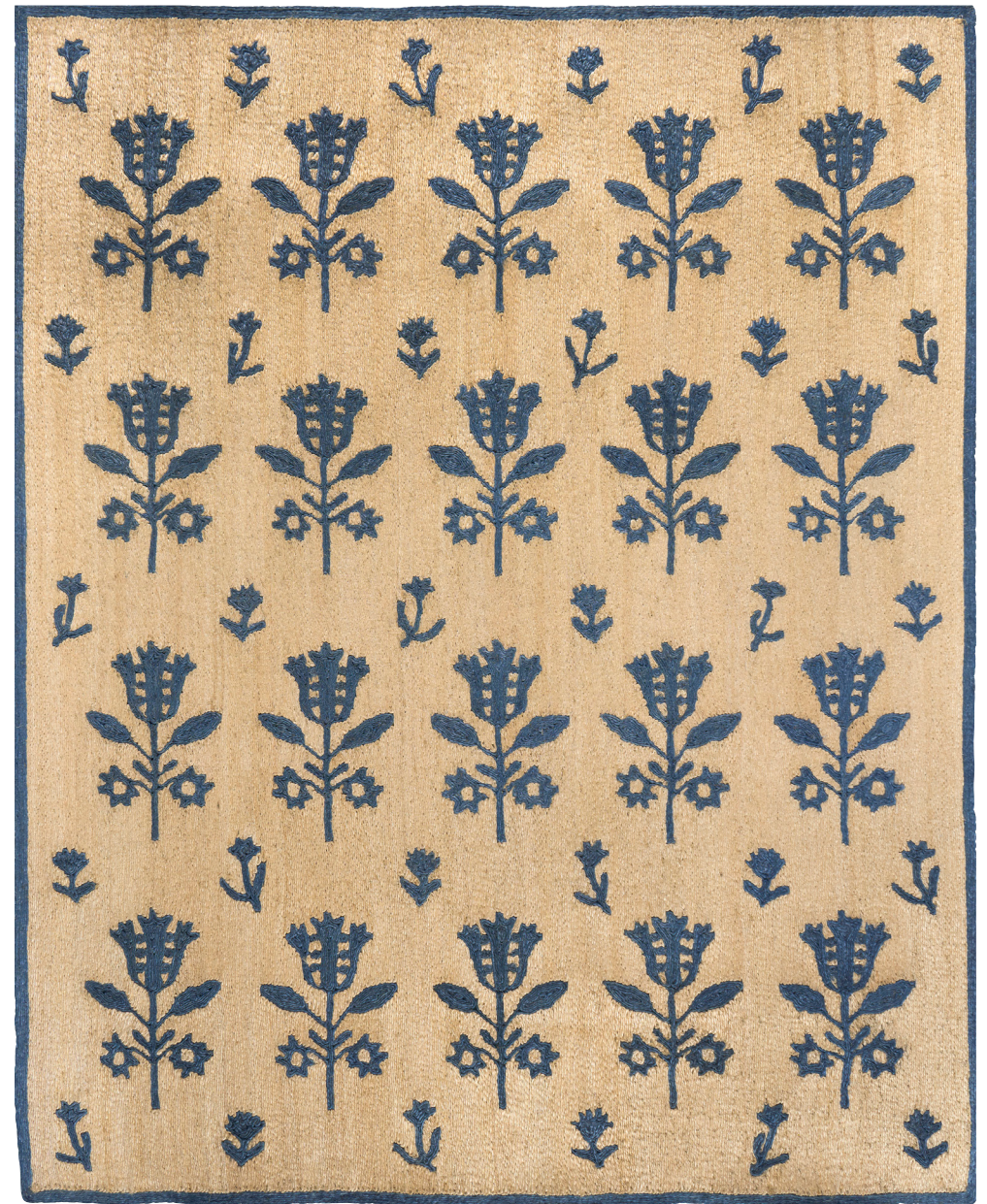
ACTUAL 8' X 10' RUG SHOWN