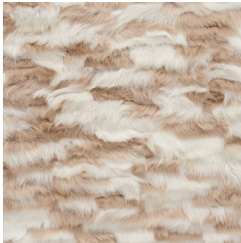
TALANO LINES HAND-STITCHED SHEEP SKIN 77833