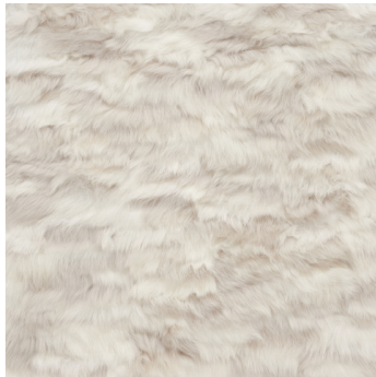
TALANO LINES HAND-STITCHED SHEEP SKIN 77828