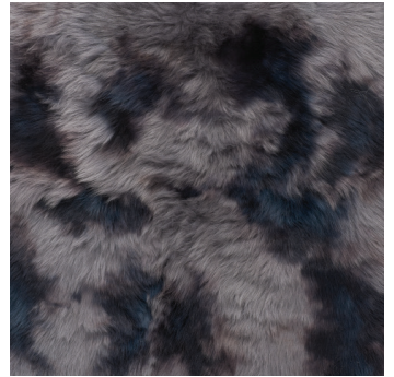
TALANO SPOTS HAND-STITCHED SHEEP SKIN 77825