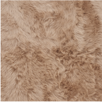
PLAIN TALANO HAND-STITCHED SHEEP SKIN 77821