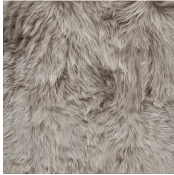
PLAIN TALANO HAND-STITCHED SHEEP SKIN 77822