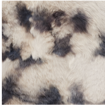
TALANO SPOTS HAND-STITCHED SHEEP SKIN 77824