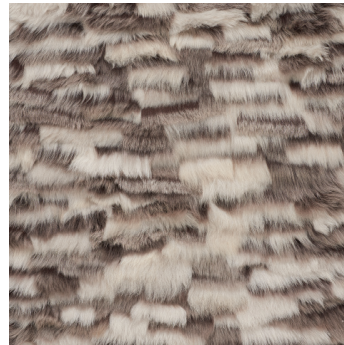
TALANO LINES HAND-STITCHED SHEEP SKIN 77827