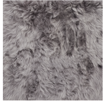
PLAIN TALANO HAND-STITCHED SHEEP SKIN 77819