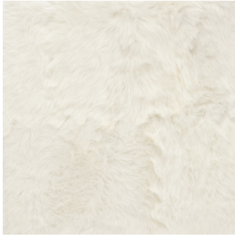
PLAIN TALANO HAND-STITCHED SHEEP SKIN 77820