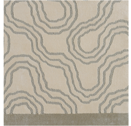
2' X 2' SAMPLE SHOWN