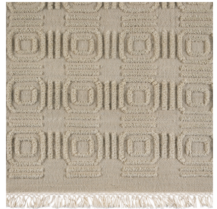
2' X 2' SAMPLE SHOWN