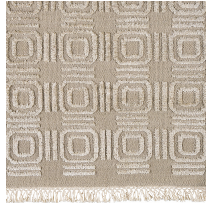
2' X 2' SAMPLE SHOWN