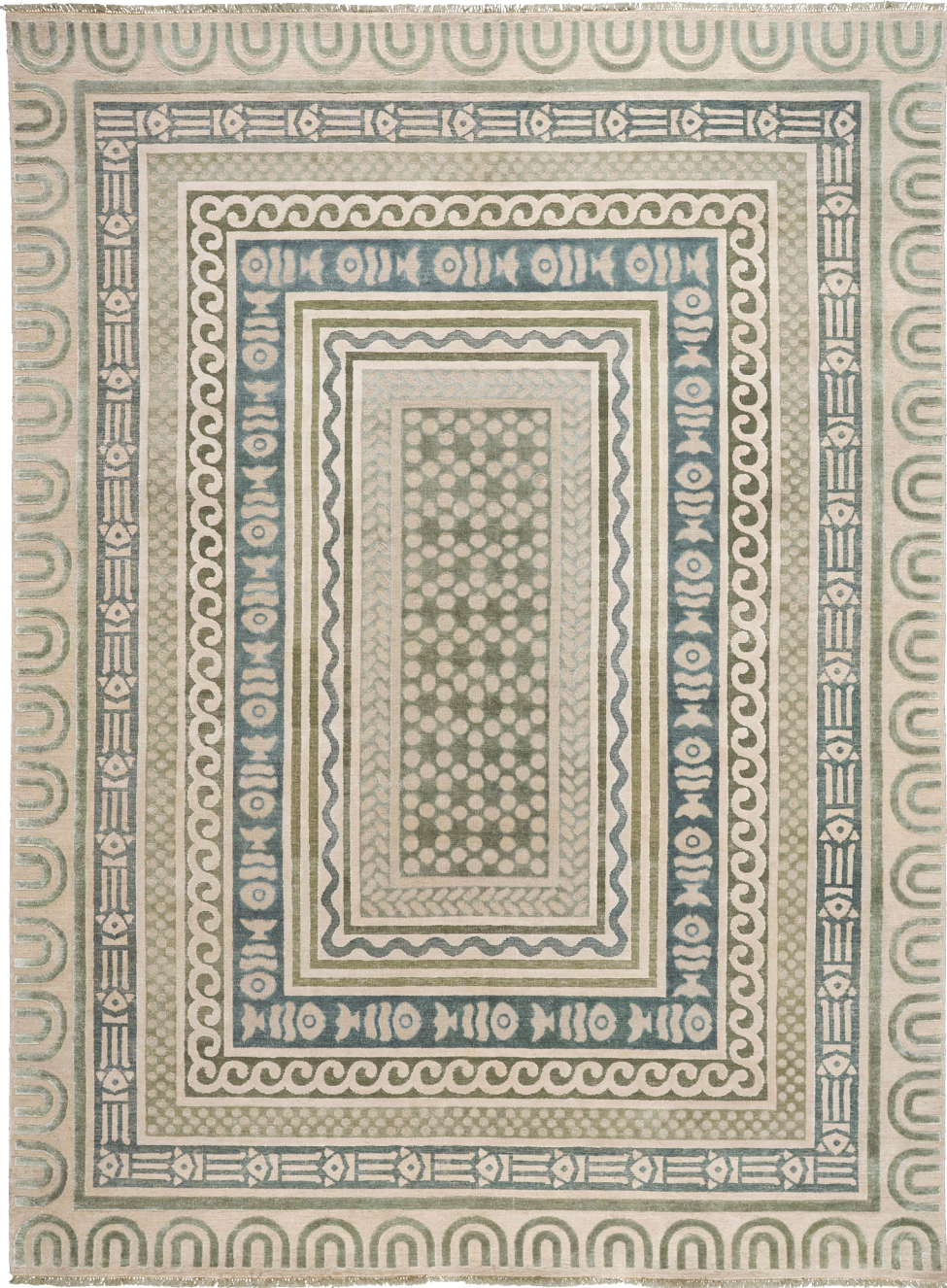
9' X 12' RUG SHOWN

COLOR: SEAGLASS FIBER: WOOL & SILK GROUP# 1189