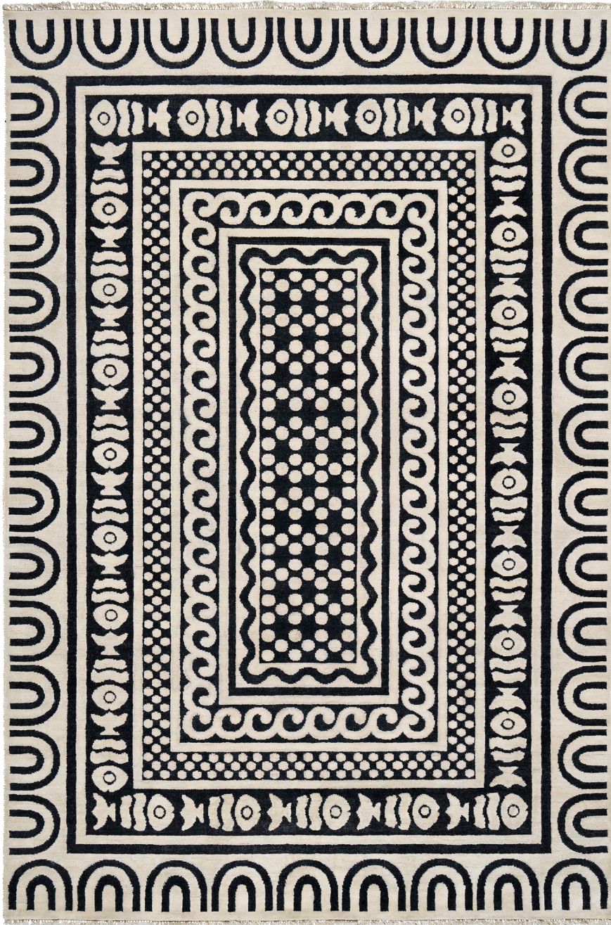
6' X 9' RUG SHOWN

COLOR: BLACK & BONE FIBER: WOOL & SILK GROUP# 1189