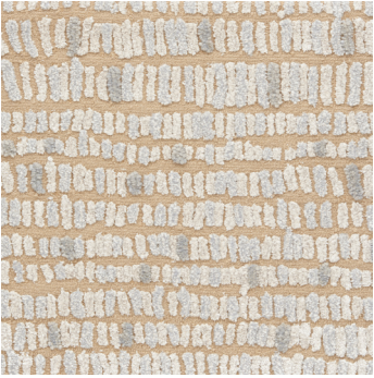
LODDEN HAND-TUFTED WOOL & FAUX SILK 73777