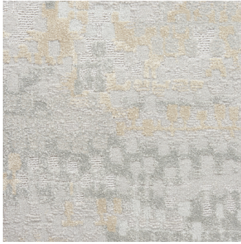
FABIEN HAND-TUFTED WOOL & FAUX SILK 73783