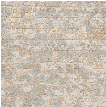
BOSTWELL HAND-TUFTED FAUX SILK & WOOL 73780