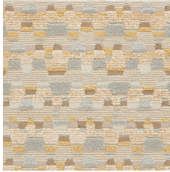
BALMER HAND-TUFTED WOOL & FAUX SILK 73773