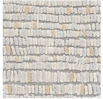
LODDEN HAND-TUFTED WOOL & FAUX SILK 74466